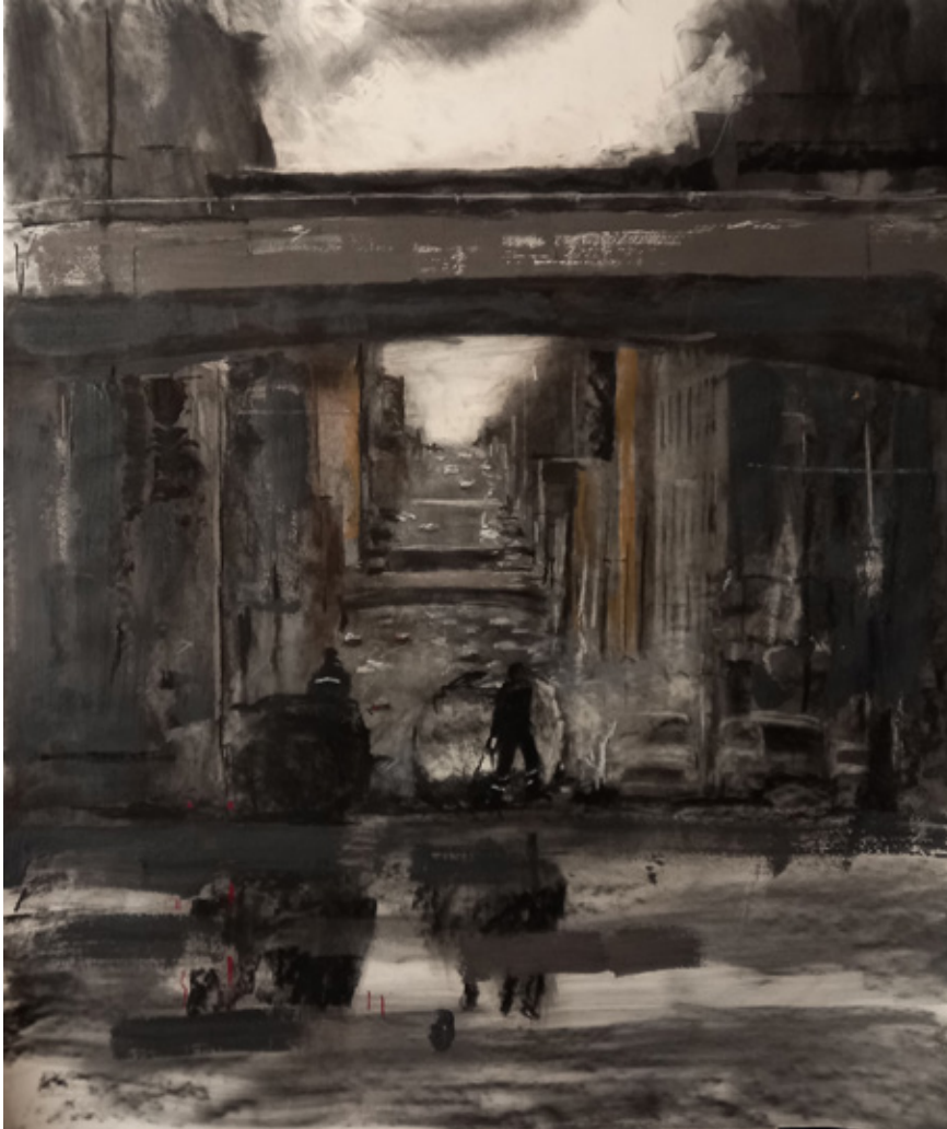
Crossing Over II

2021 160cm x 150cm (framed) Charcoal on paper