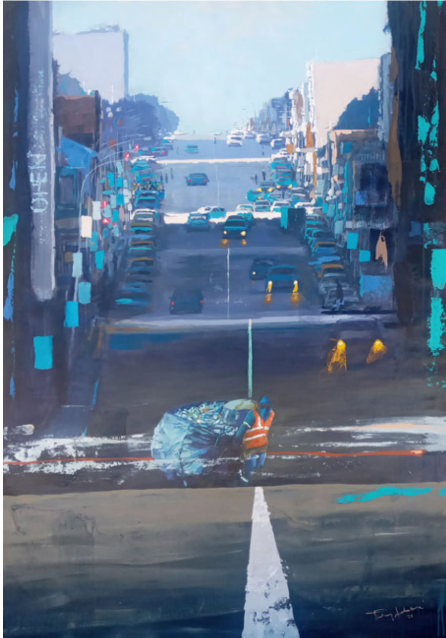
Crossing the line