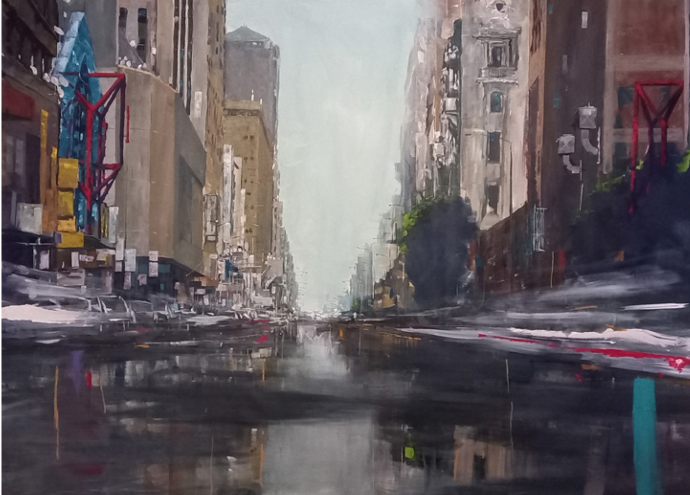
Small Street pace