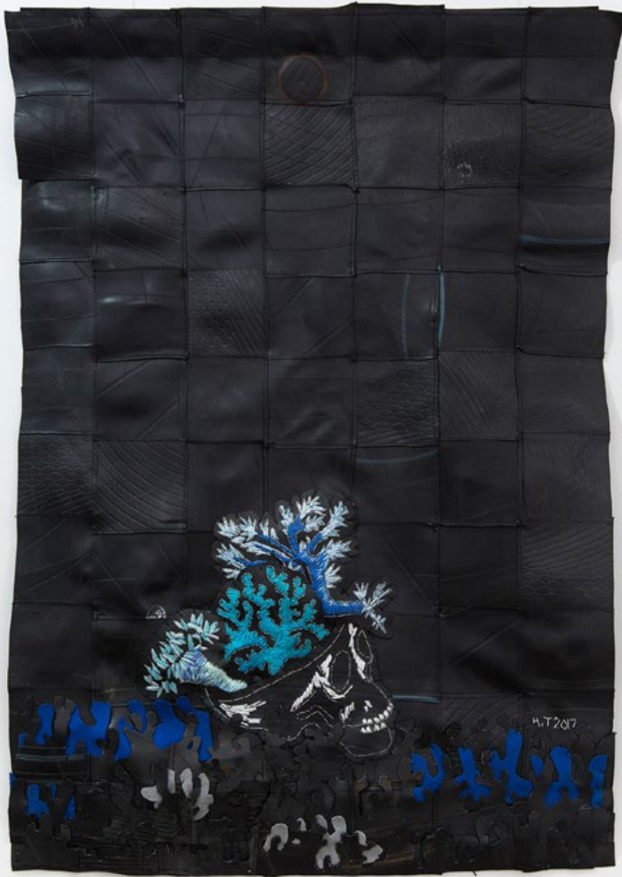
Between The Devil And The Deep Blue Sea Rubber, cotton thread and felt | 102 x 65 cm | R17 800