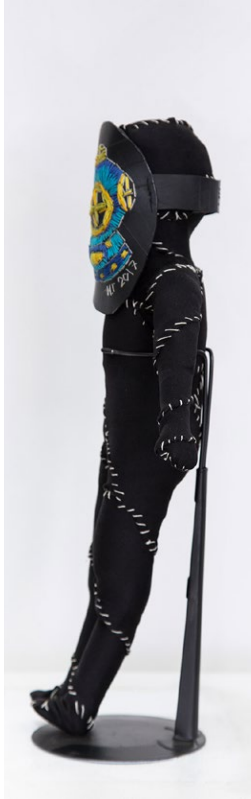
Aquarian Found object, rubber, cotton thread and fabric 40 x 23 x 10 cm | R6 000