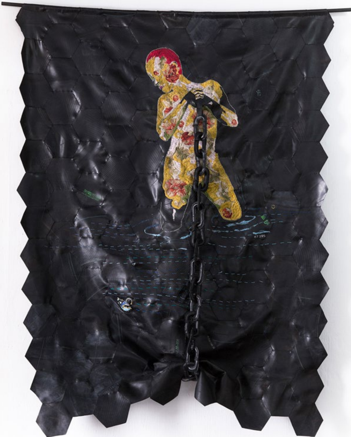
Still Waters Run Deep Rubber, cotton thread, batting and wool | 220 x 161 cm | R45 600