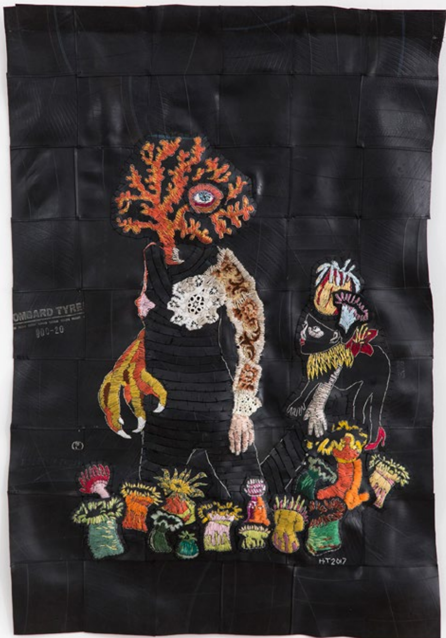
Catch Of The Day

Rubber and cotton thread | 112 x 76 cm | R 18 850