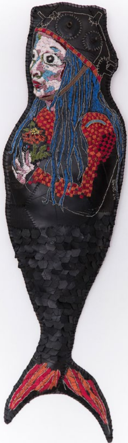
Water Up To The Throat Rubber, cotton thread and felt | 125 x 35 cm | R18 050