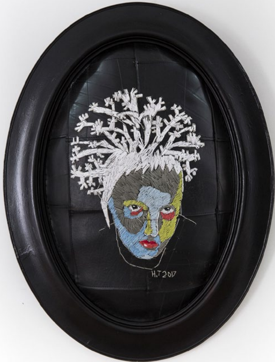
She Does Not Hold Water Rubber, cotton thread, batting and wool | 63.5 x 49 cm | R14 000