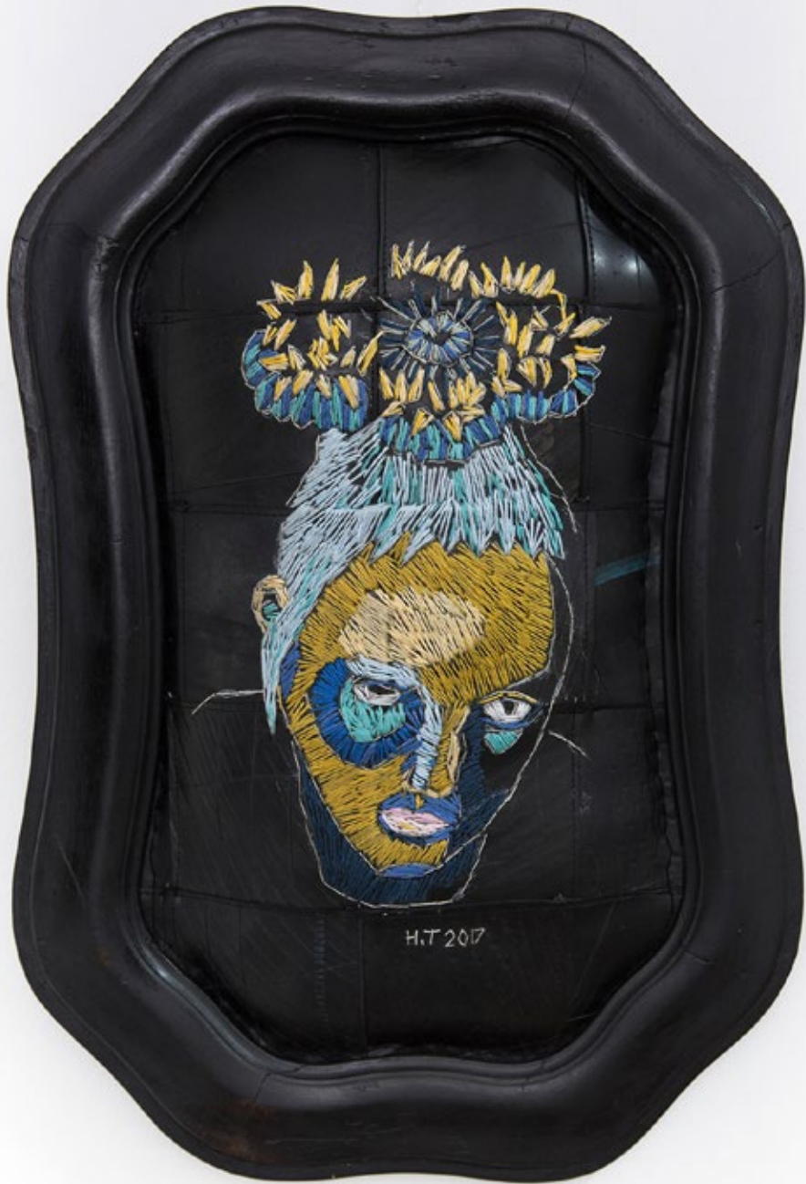
Don't Make Waves Rubber, cotton thread, batting and wool | 54 x 35 cm | R14 000