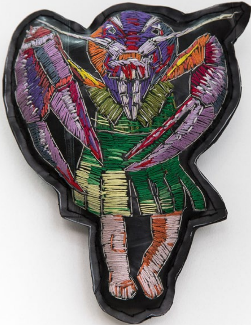
Kreef Rubber, cotton thread and batting | 22 x 18 x 5 cm | R4700