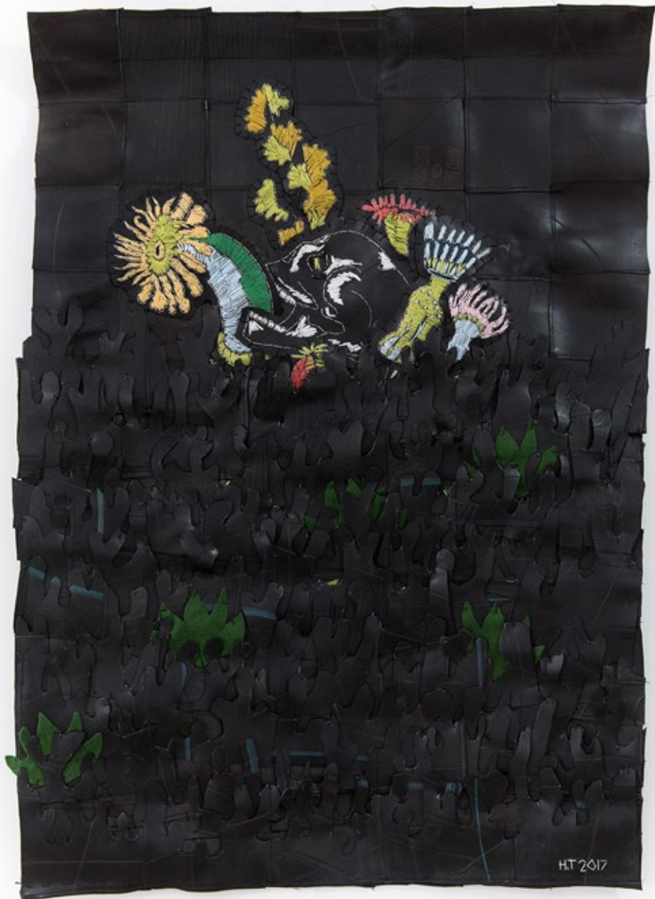
The Ocean Is Not Greener On The Other Side Rubber, cotton thread and felt | 92 x 66 cm | R17 800