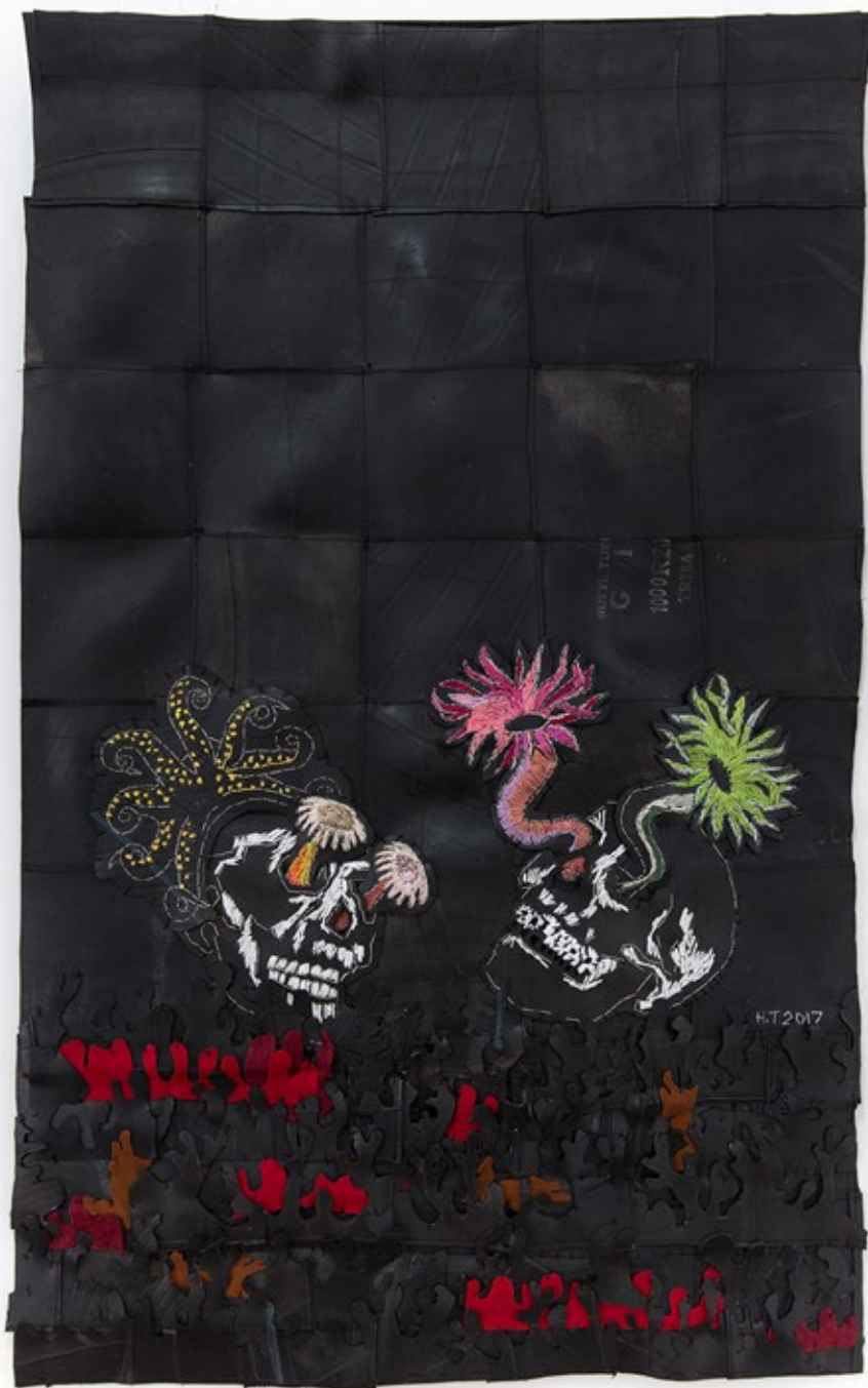
Come Hell Or High Water Rubber, cotton thread and felt | 102 x 65 cm | R17 800