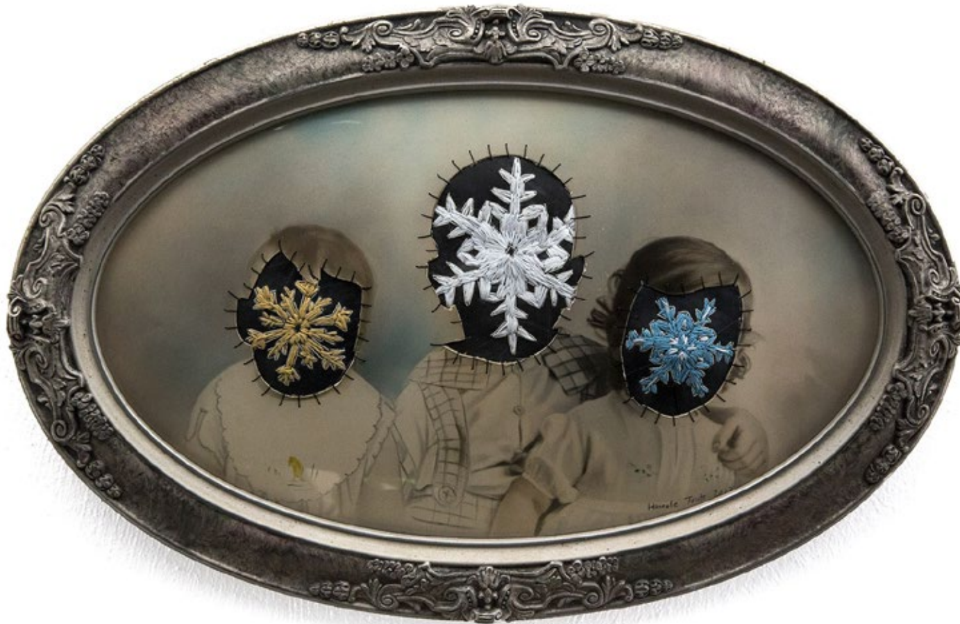
Blood Is Thicker Than Water Vintage photograph, cotton thread and rubber | 58.5 x 38 cm | R20 200