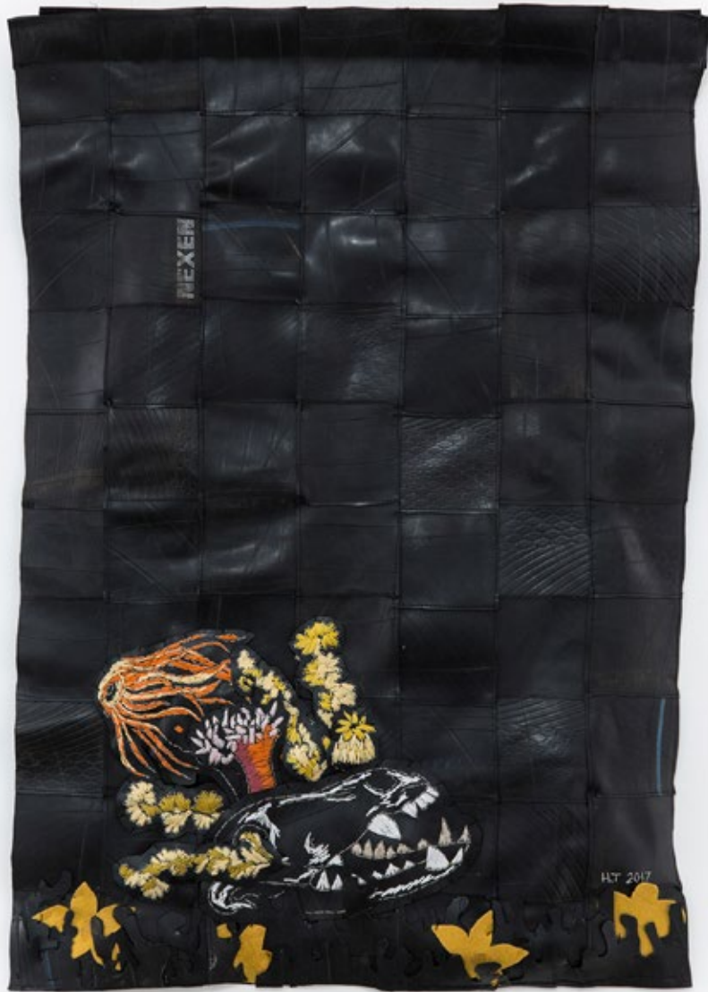
To Be Dead In Water Rubber, cotton thread and felt | 102 x 65 cm | R17 800