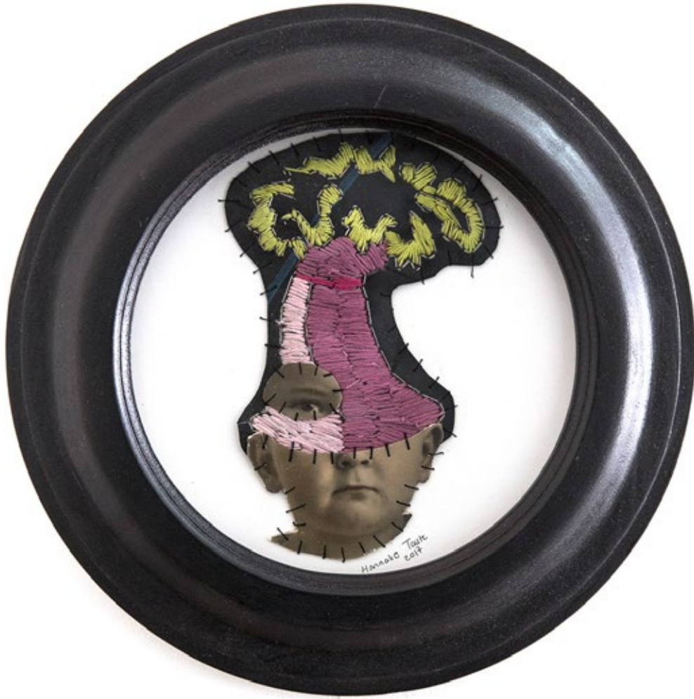
He Does Not Live In A Pineapple Under The Sea Photograph, cotton thread, batting and rubber | 36 cm Diameter | R6 300