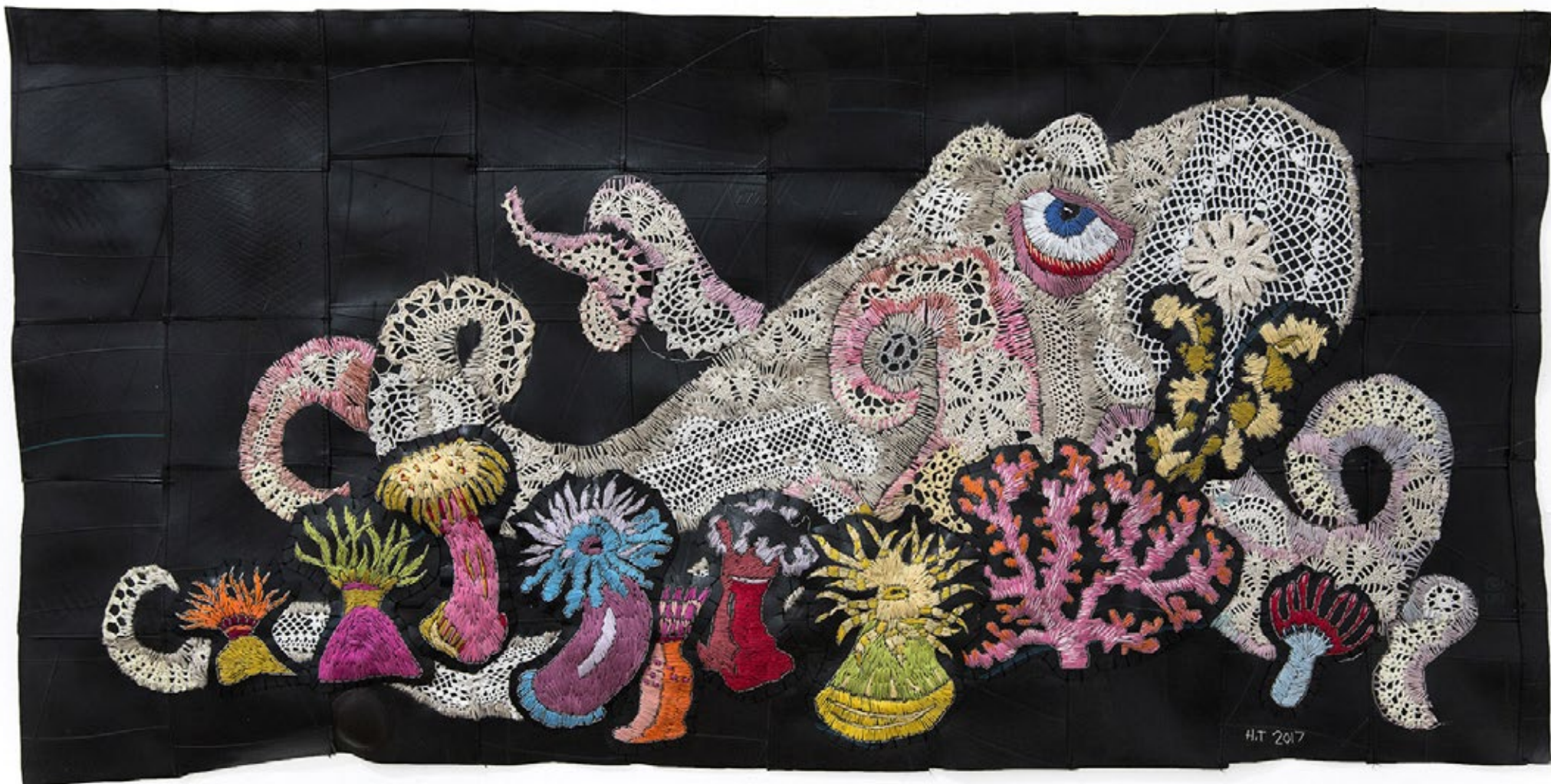
In Warm Water Rubber, cotton thread and doilies | 130 x 65 cm | R23 400