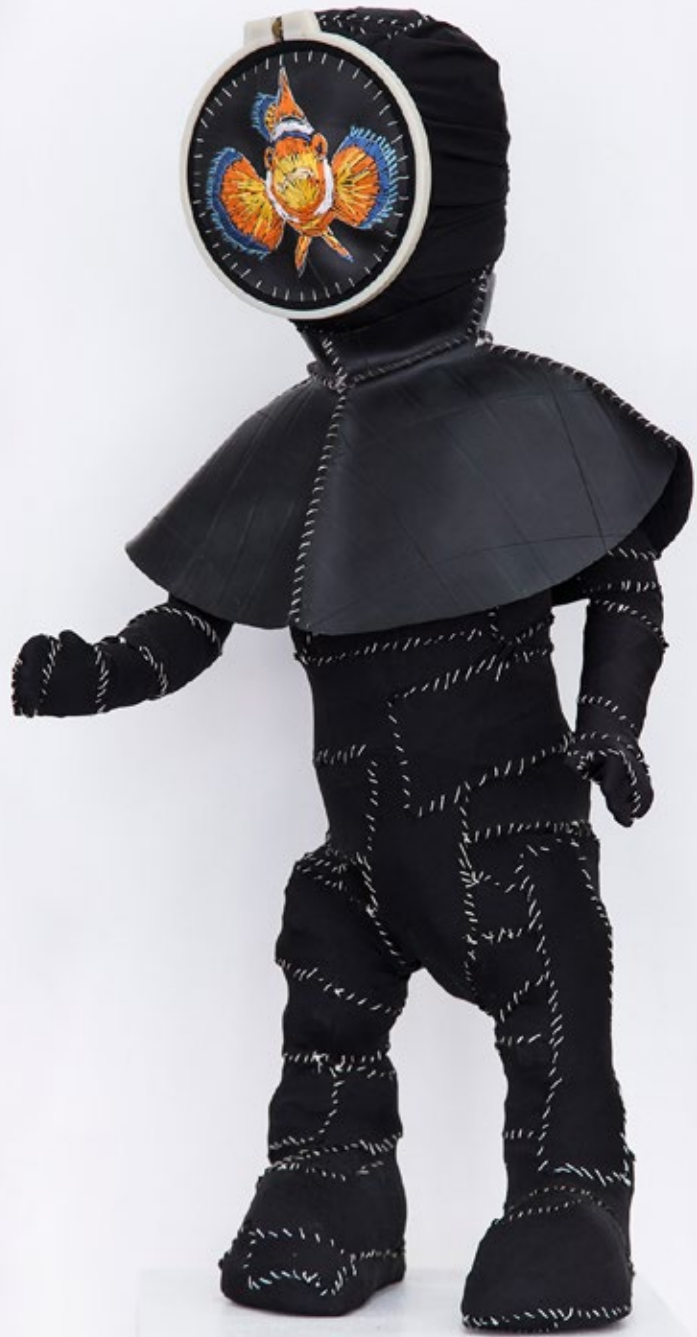
Like A Fish Out Of Water Found object, rubber, cotton thread and fabric | 72 x 40 x 30 cm | R19 400