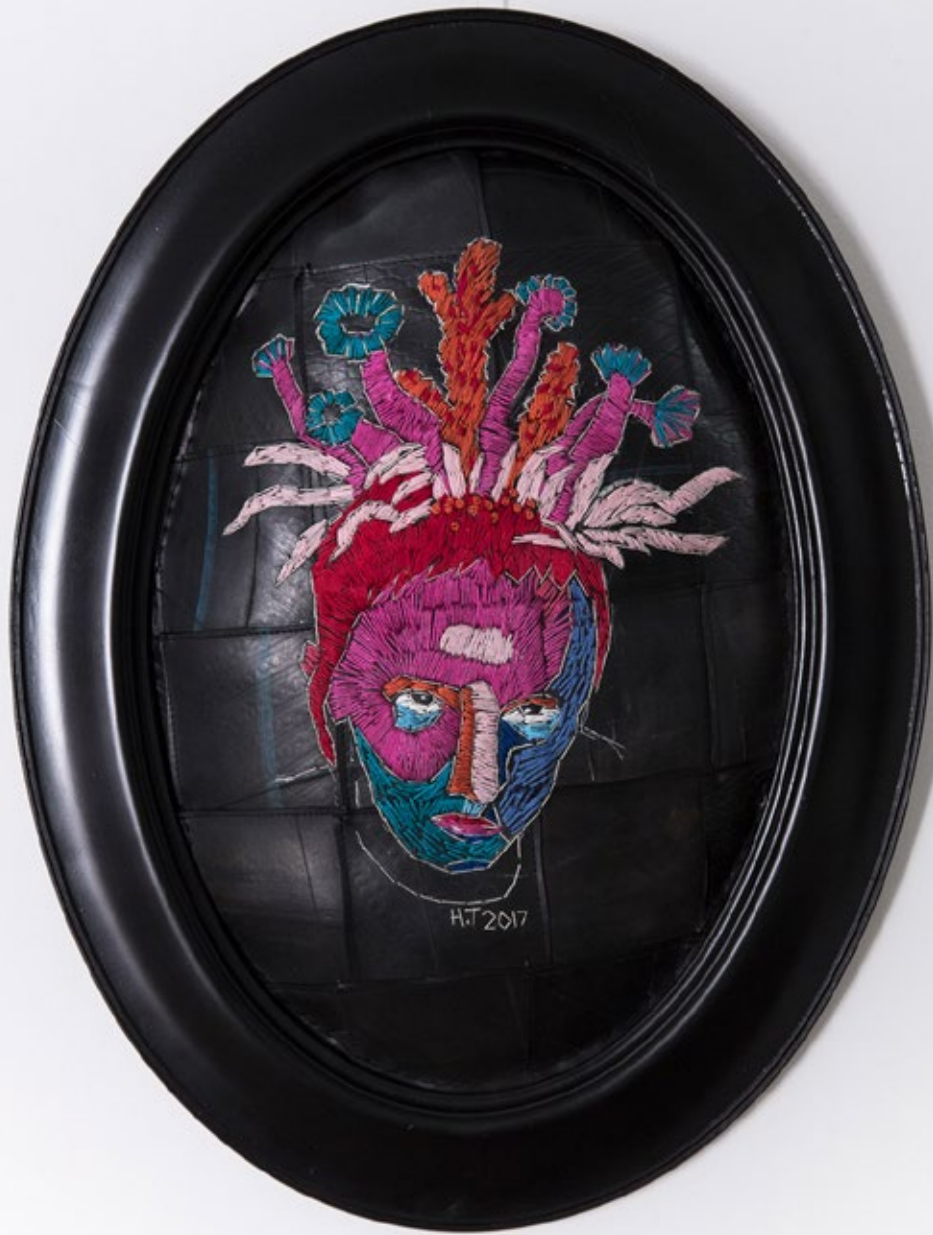
Fountain Of Youth Rubber, cotton thread, batting and wool | 63.5 x 49 cm | R14 000