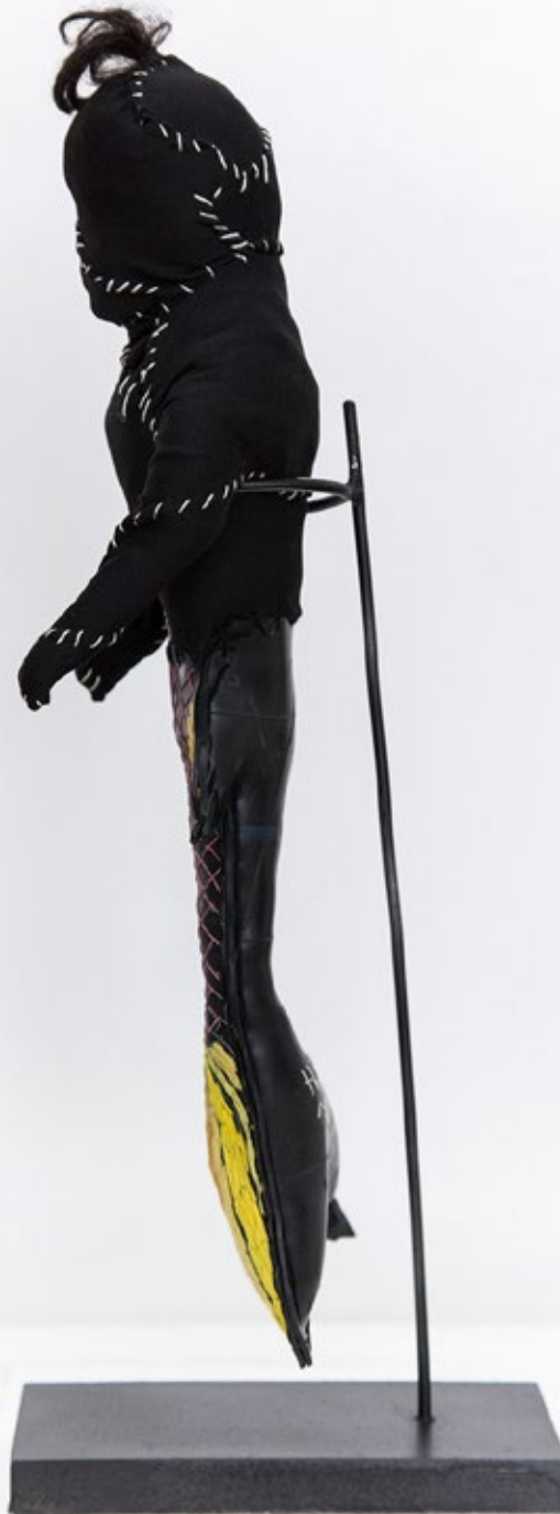
The Little Mermaid Found object, rubber, cotton thread and fabric 43 x 17 x 10 cm | R6 000