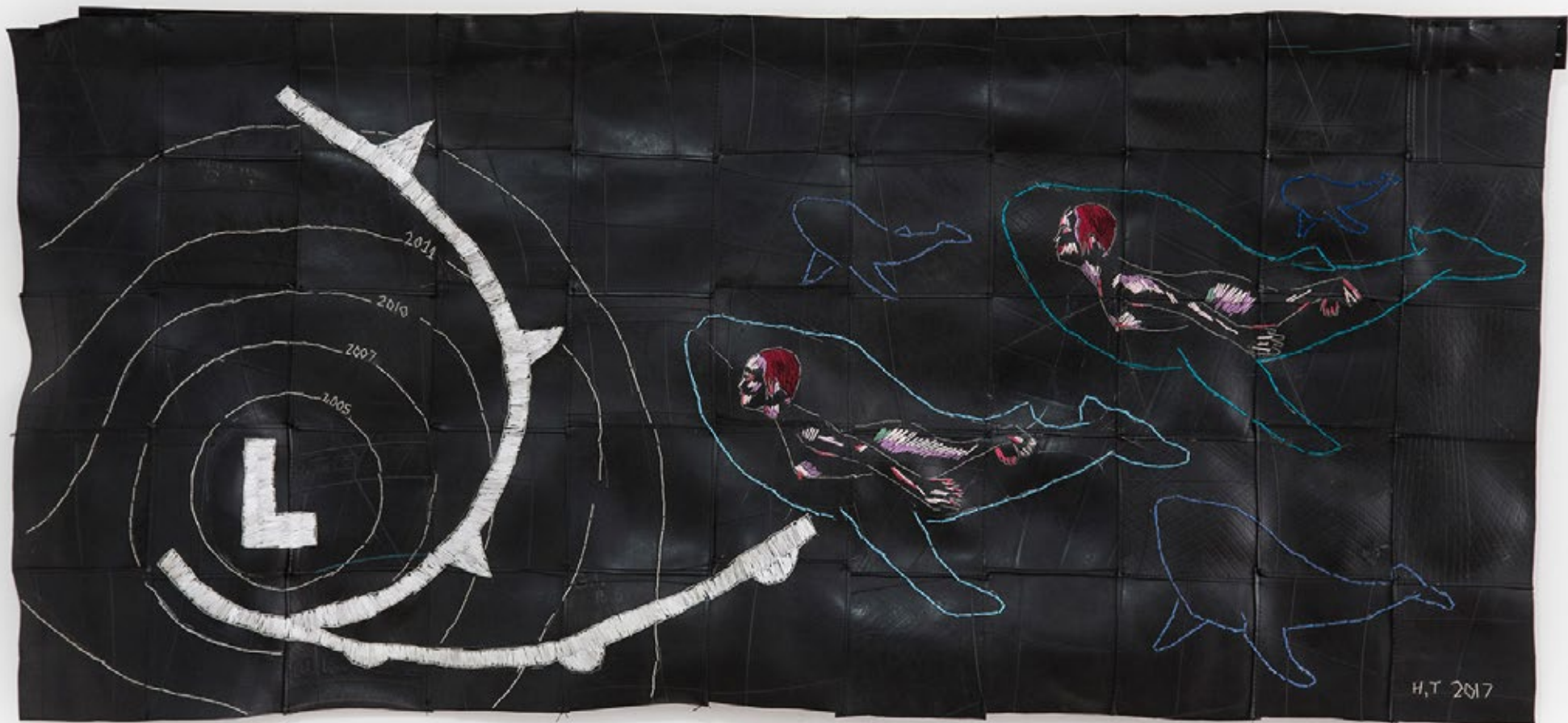
A Whale Of A Time Rubber and cotton thread | 63 x 137 cm | R21 600