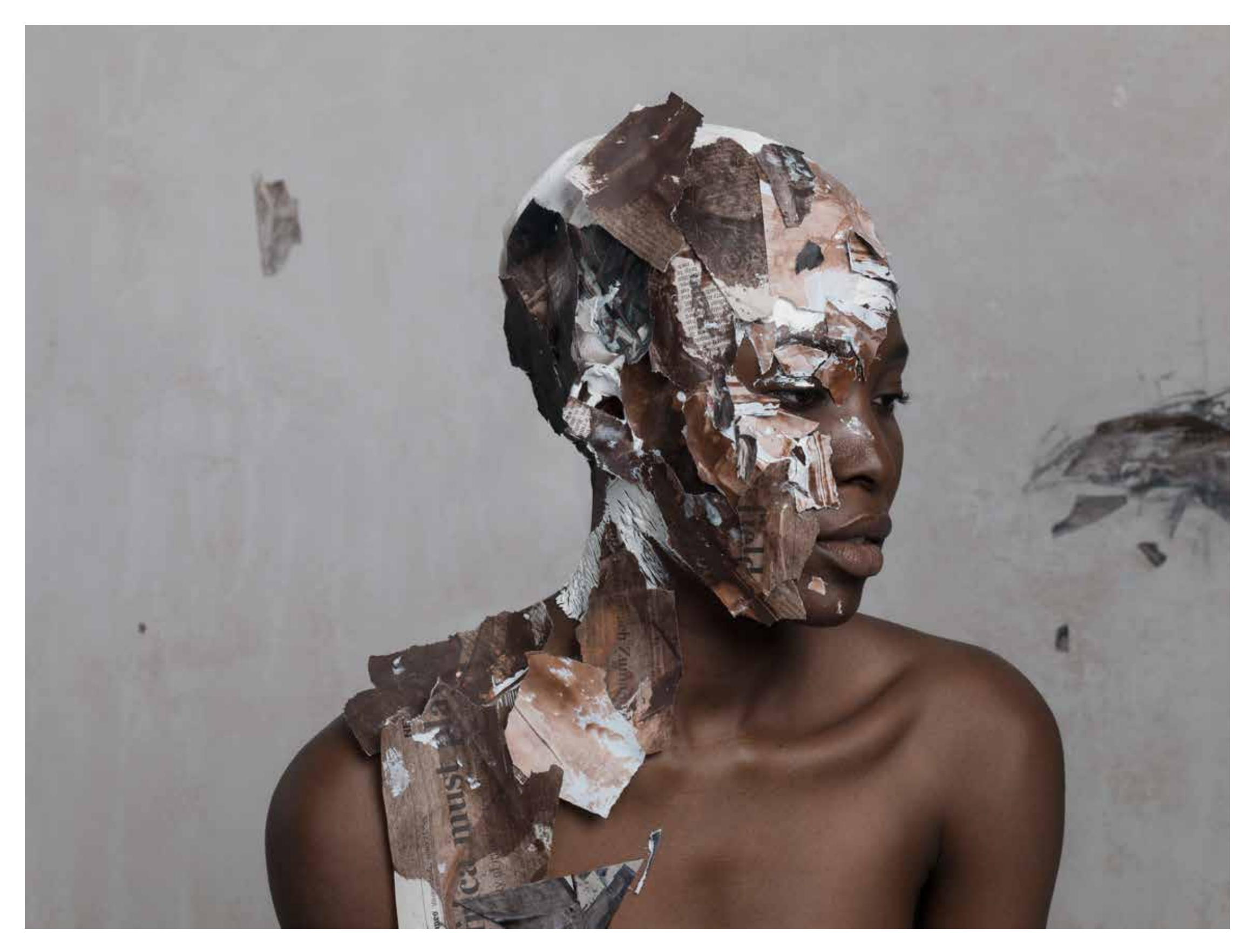
Justin Dingwall and Benon Lutaaya. Affinity. 2016. Photographic Gliclée print on 100% cotton fine art paper and collage. Variable edition of 3

Ed 1/3 R 60 000,00 (Framed) | Ed 2/3 R 66 000,00 (Framed) | Ed /33 R 72 600,00 (Framed)