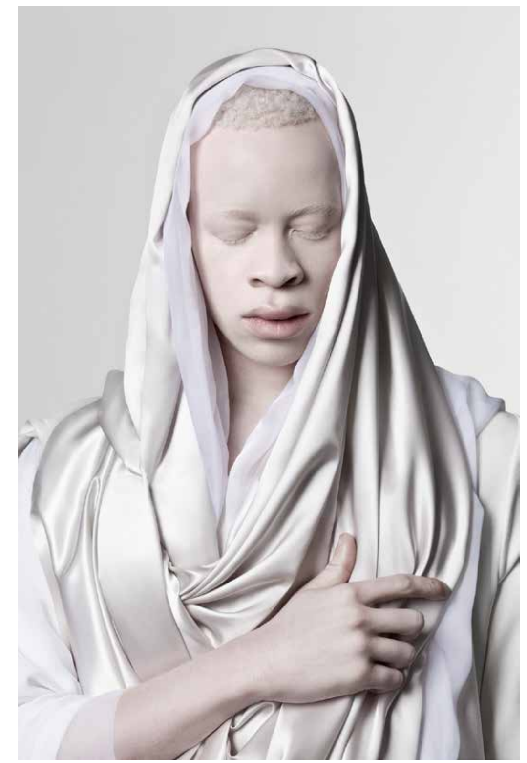
Justin Dingwall. Albus I - Albus II 2015. Photographic Gliclée print on 100% cotton fine art paper, Edition of 10 (each)