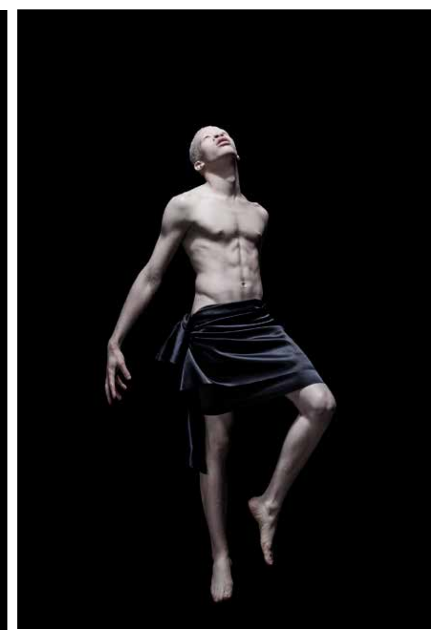
Justin Dingwall. Rhapsody I - III 2015. Photographic Gliclée print on 100% cotton fine art paper, Edition of 10 (each)