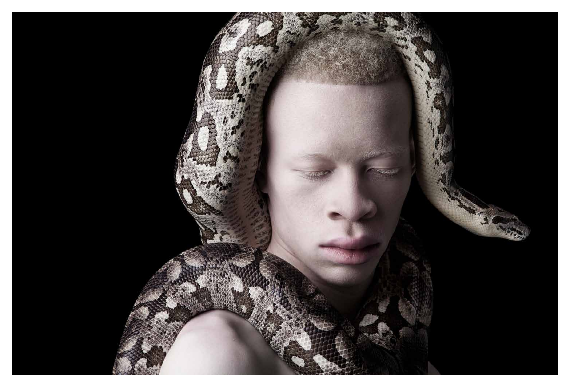
Justin Dingwall. Rebirth 2015. Photographic Gliclée print on 100% cotton fine art paper, Edition of 10