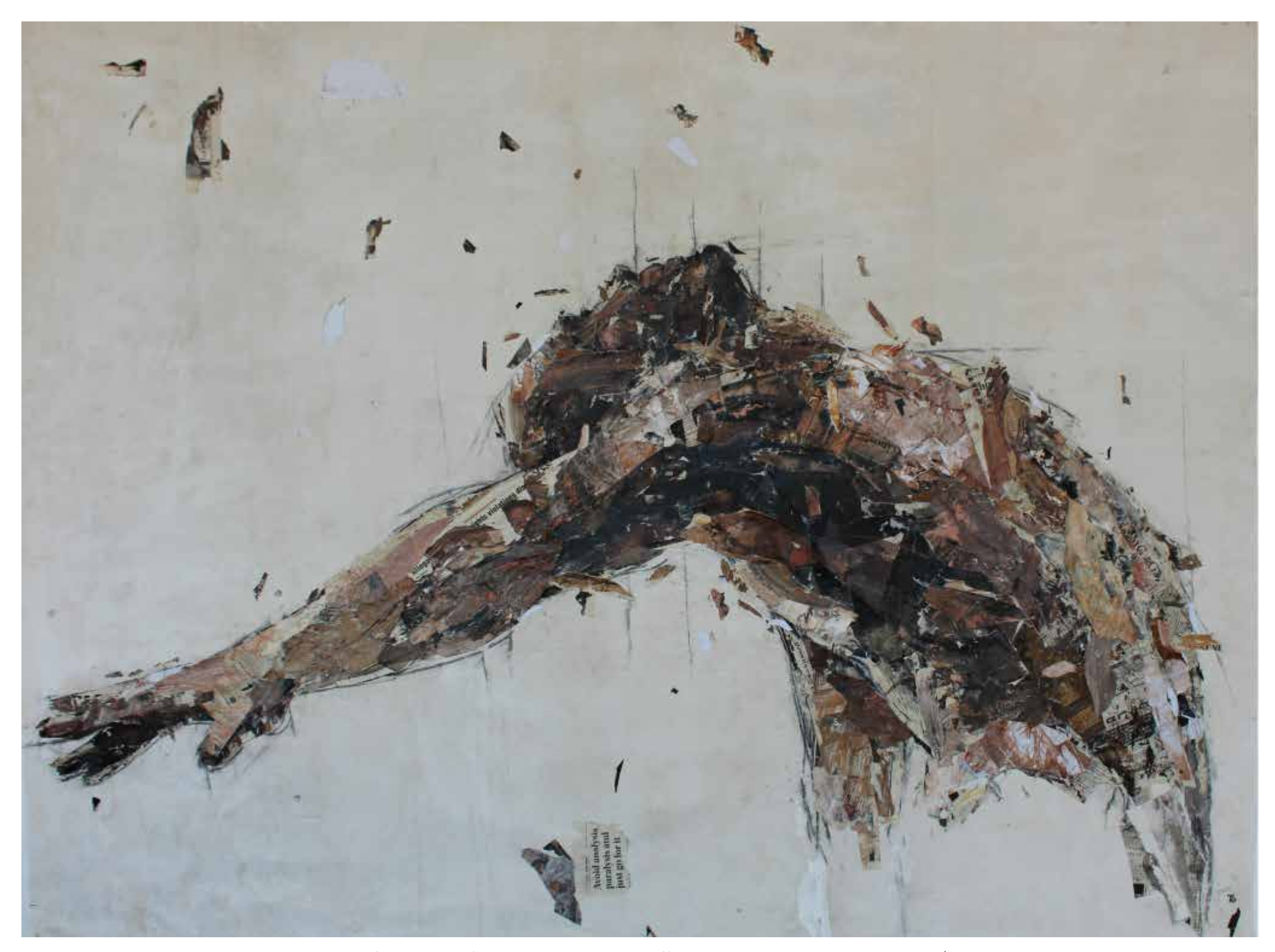
Benon Lutaaya. What's Freedom? 2016. Paper collage on canvas,151 x 198 cm | R175 000,00