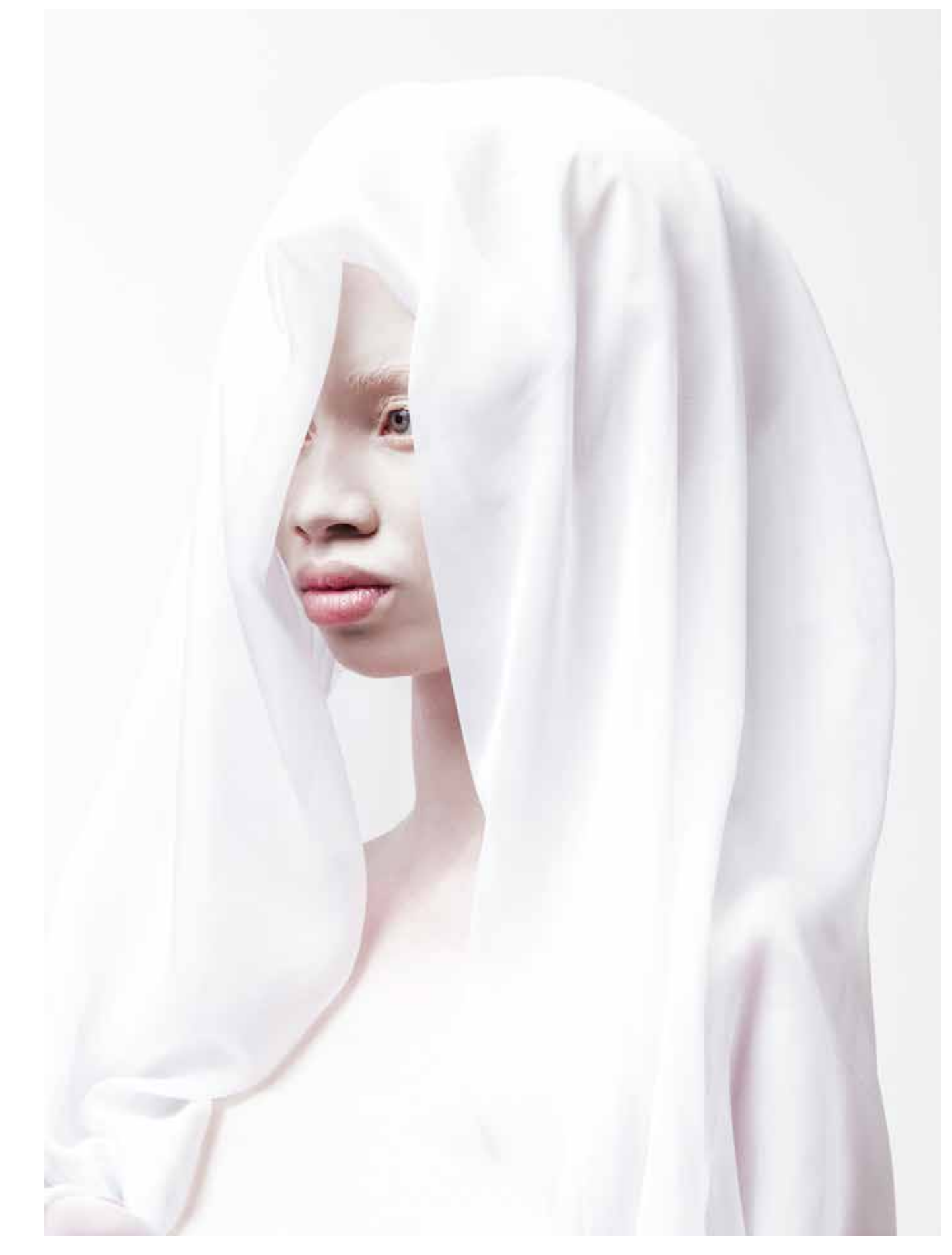
Justin Dingwall. White Veil 2013. Photographic Gliclée print on 100% cotton fine art paper, Edition of 10