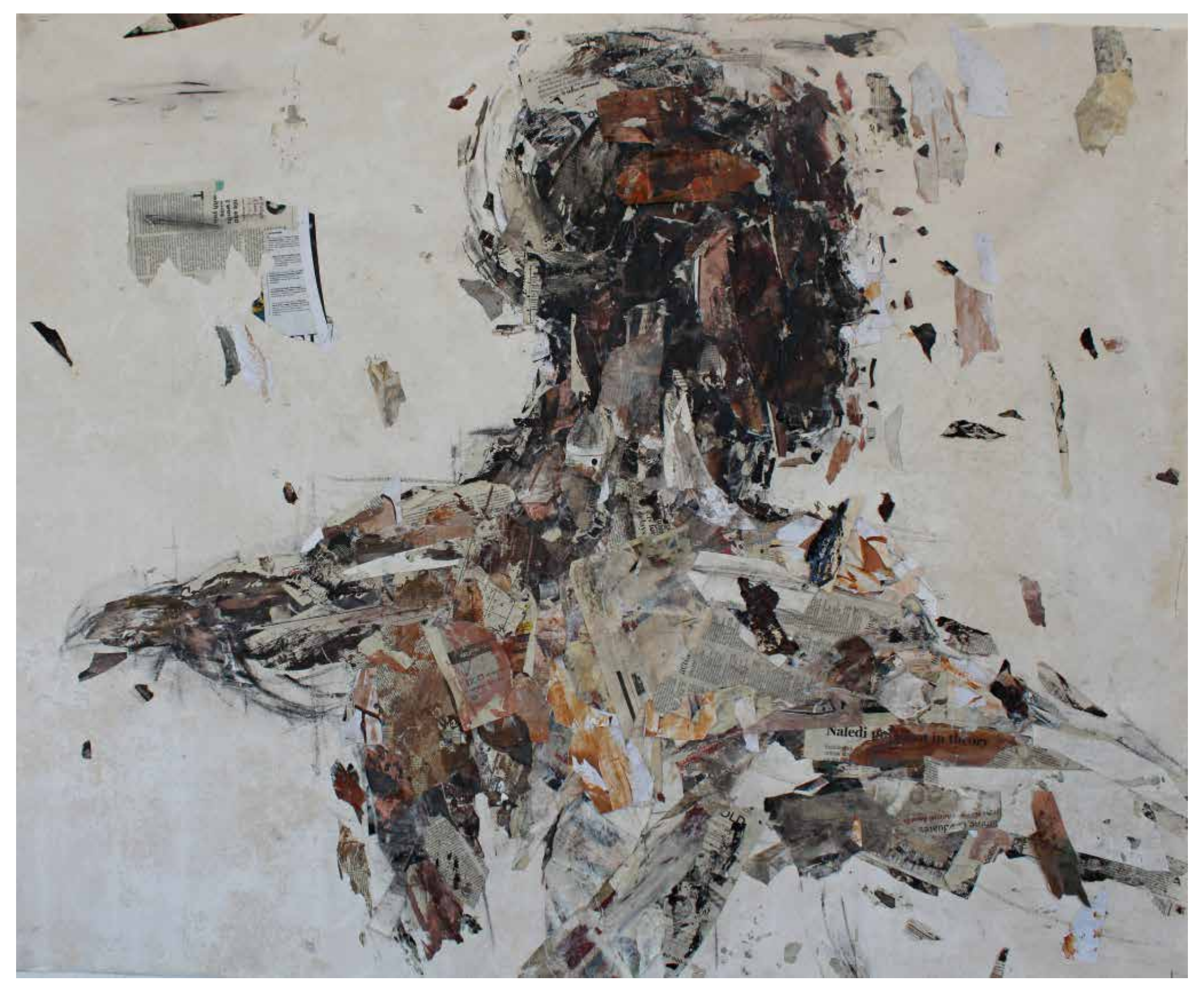
Benon Lutaaya. Pursuit of Freedom. 2016. Paper collage on canvas, 120 x 147 cm | R100 000,00