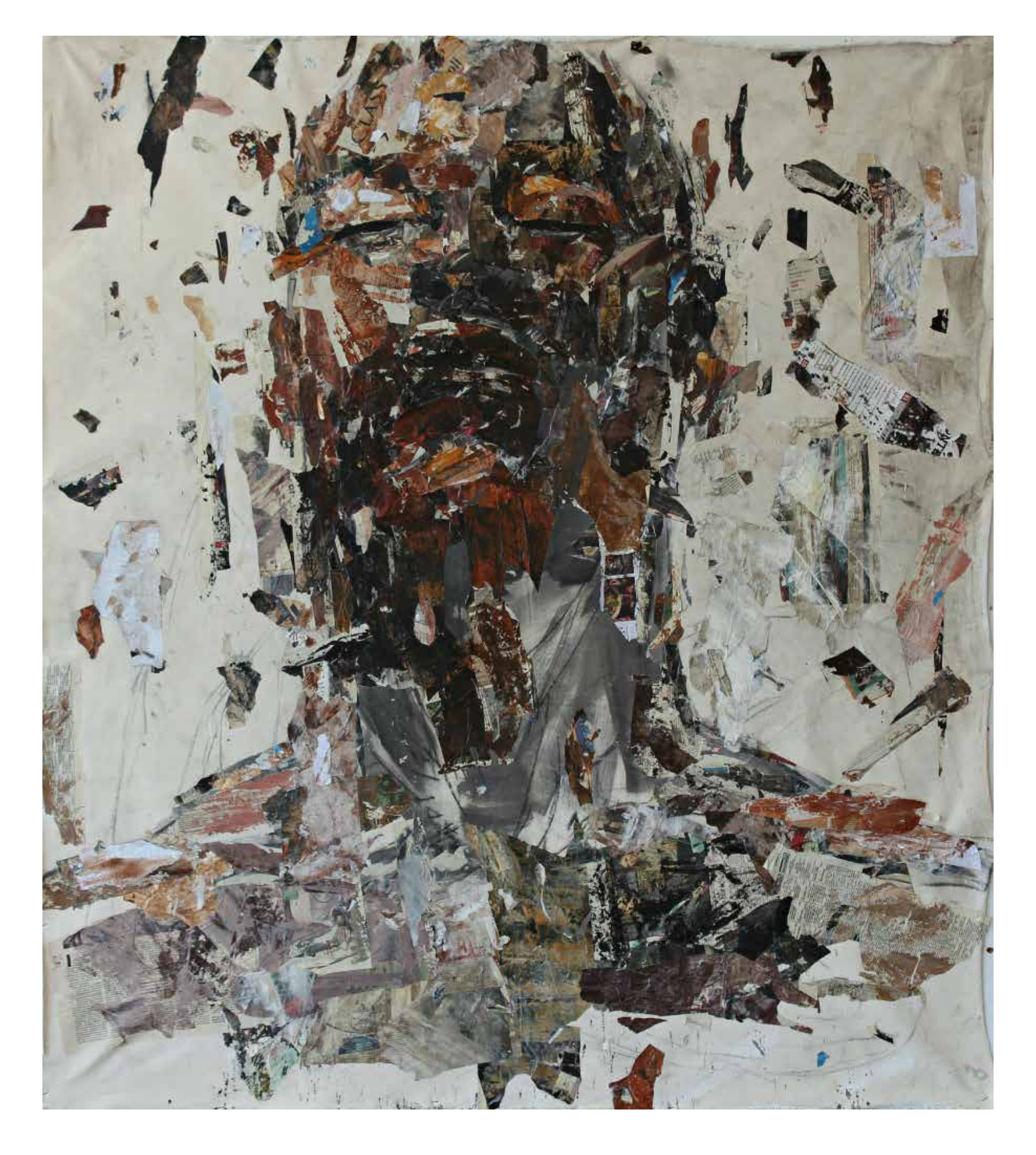
Benon Lutaaya. Distant regards. 2016. Paper collage on canvas,164 x 148cm | R160 000,00