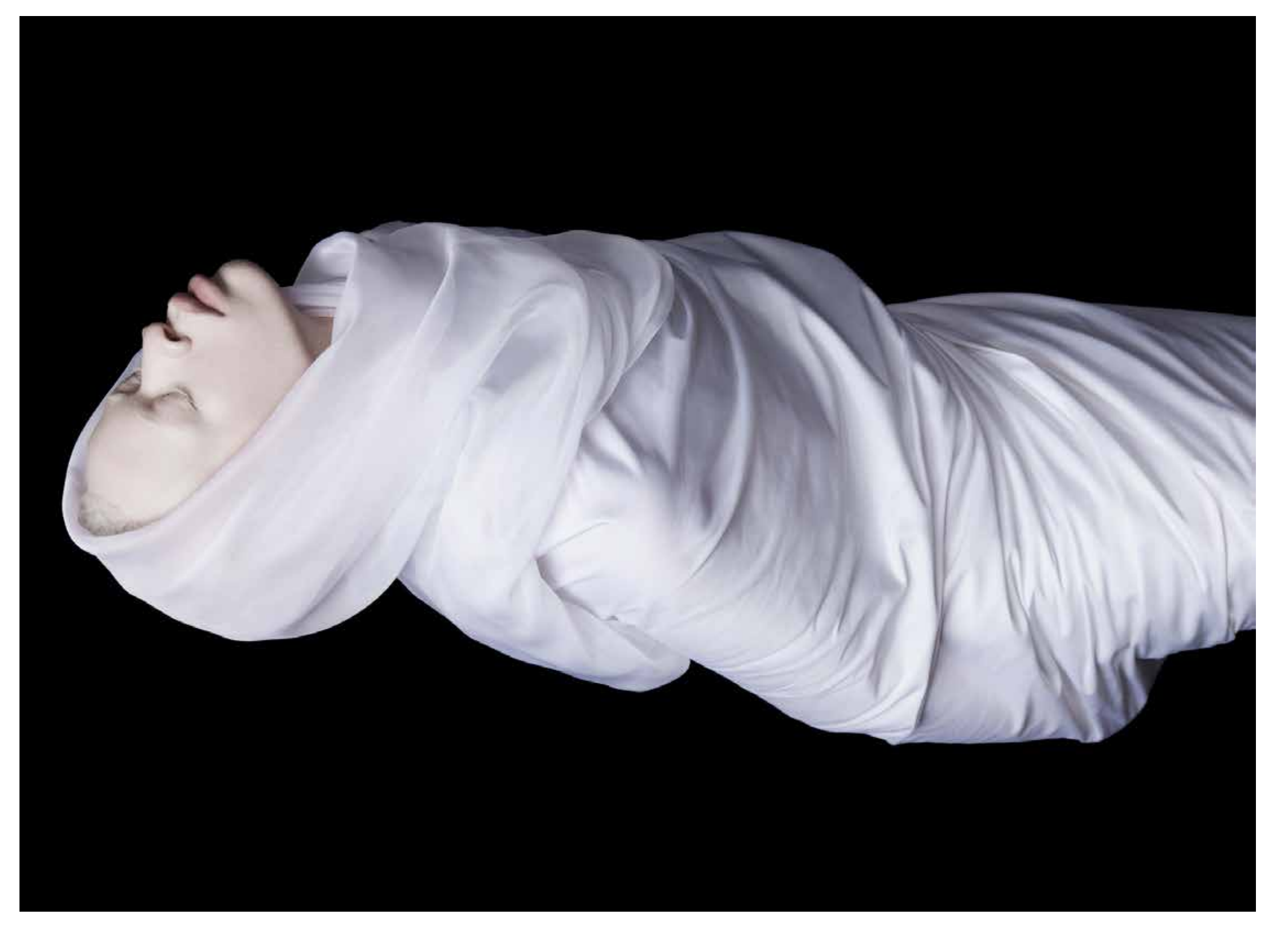
Justin Dingwall. Embrace 2015. Photographic Gliclée print on 100% cotton fine art paper, Edition of 10