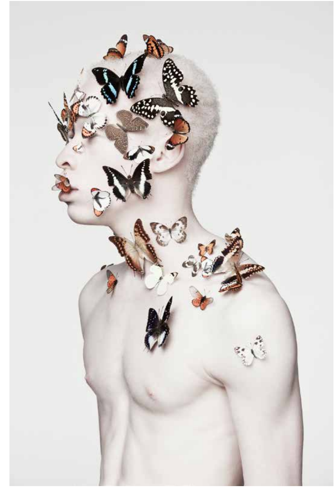
Justin Dingwall. Mob I - Mob II 2015. Photographic Gliclée print on 100% cotton fine art paper, Edition of 10 (each)