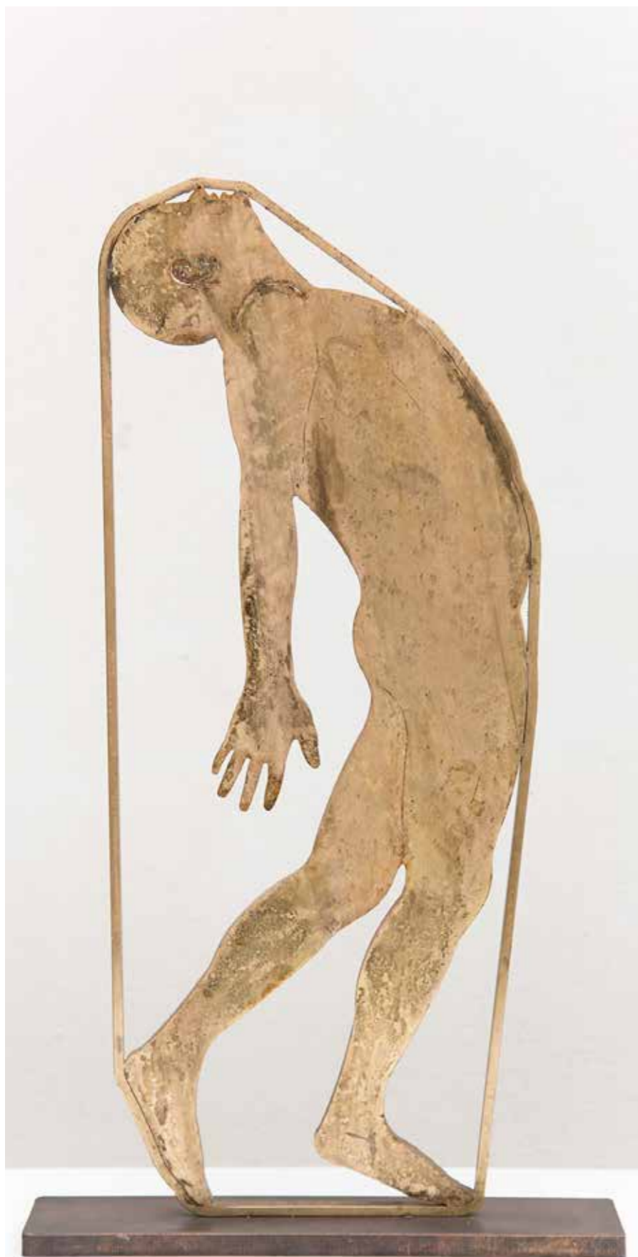
Uwe Pfaff | I am not ready yet | 2016 | Grass plated steel | 56 x 32 x 7 cm, Edition 2 of 9 | R 7 980.00