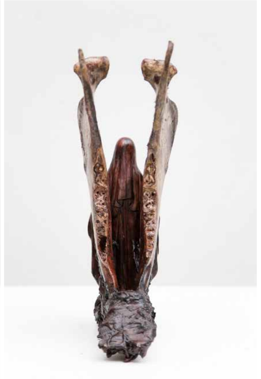
Lwandiso Njara | They Came Across the Ocean (Scene I) | 2017 | Resin, animal bone, wax polish, patina | 30 x 14 x 37 cm, Edition 5 of 8 | R 4 560.00