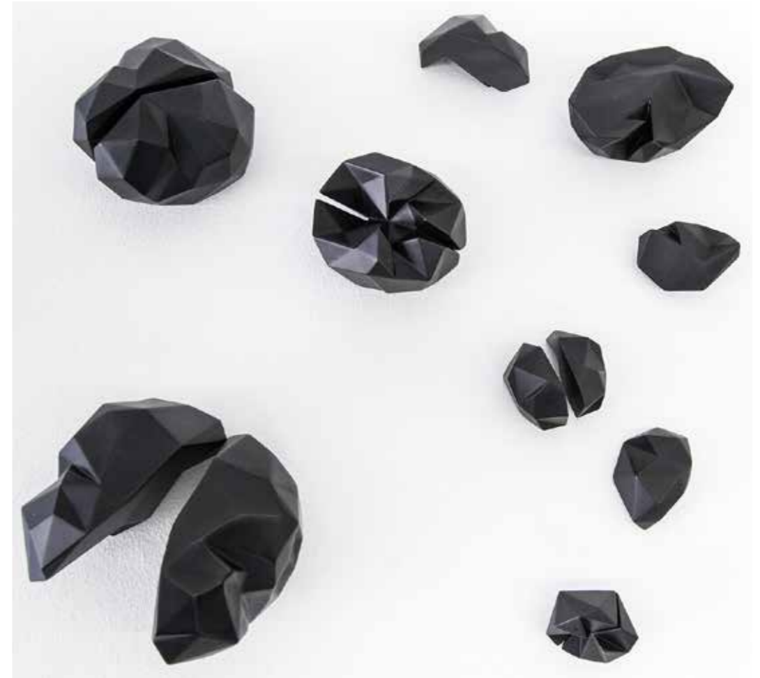
Marco Cianfanelli | Cerebral Aspects | 2017 | Painted plastic 3D print | Dimensions Variable | Price on Request | Bronze version available to order