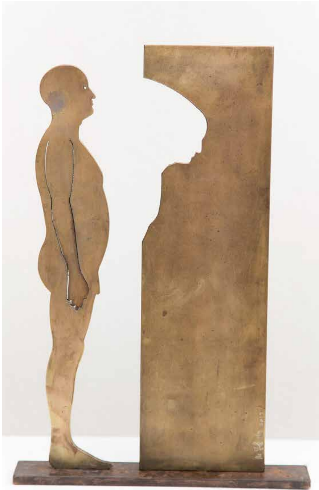
Uwe Pfaff | I have seen the future | 2017 | Brass plated steel | 39 x 26 x 5 cm, Edition 1 of 7 | R 4 500.00