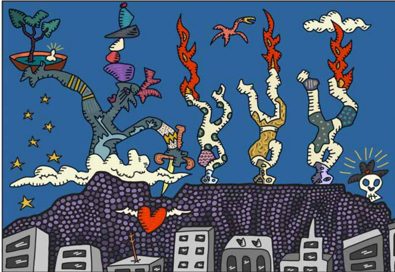
Fire on the mountain