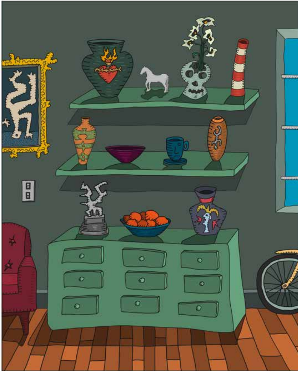
Interior with small white horse 2020