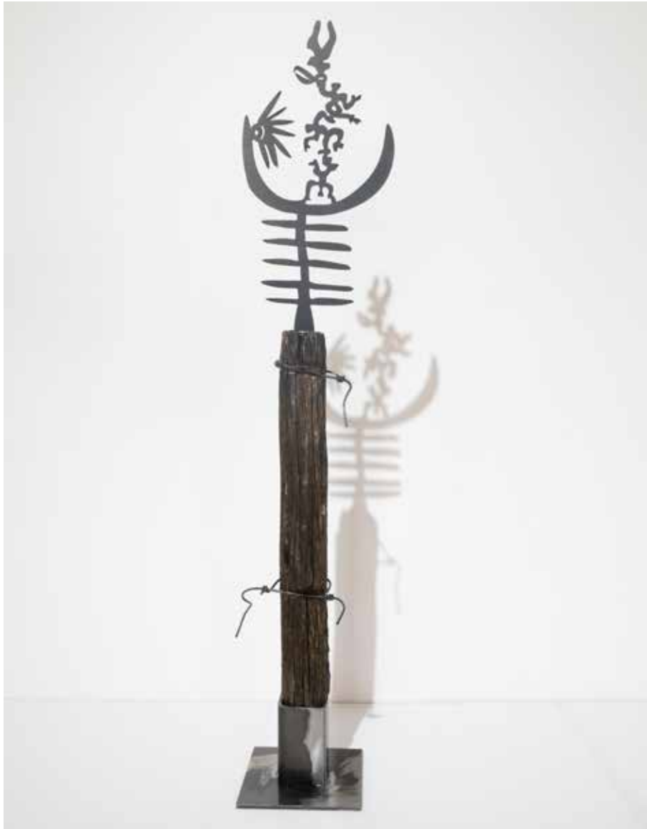
Bird by bird