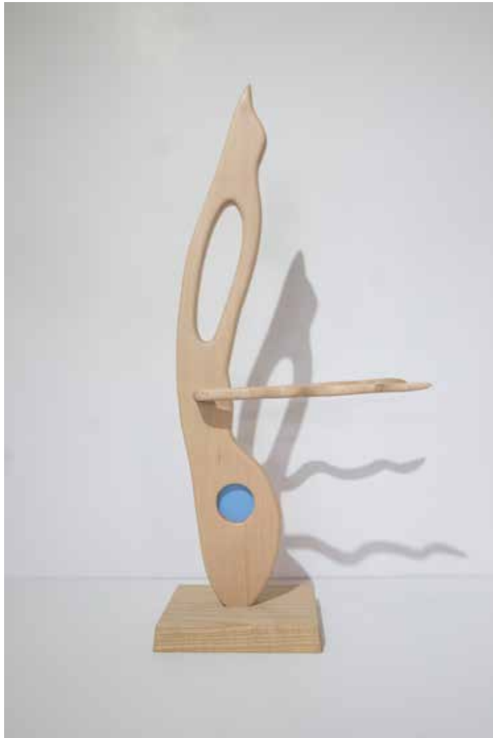
The bird man of Alcatraz