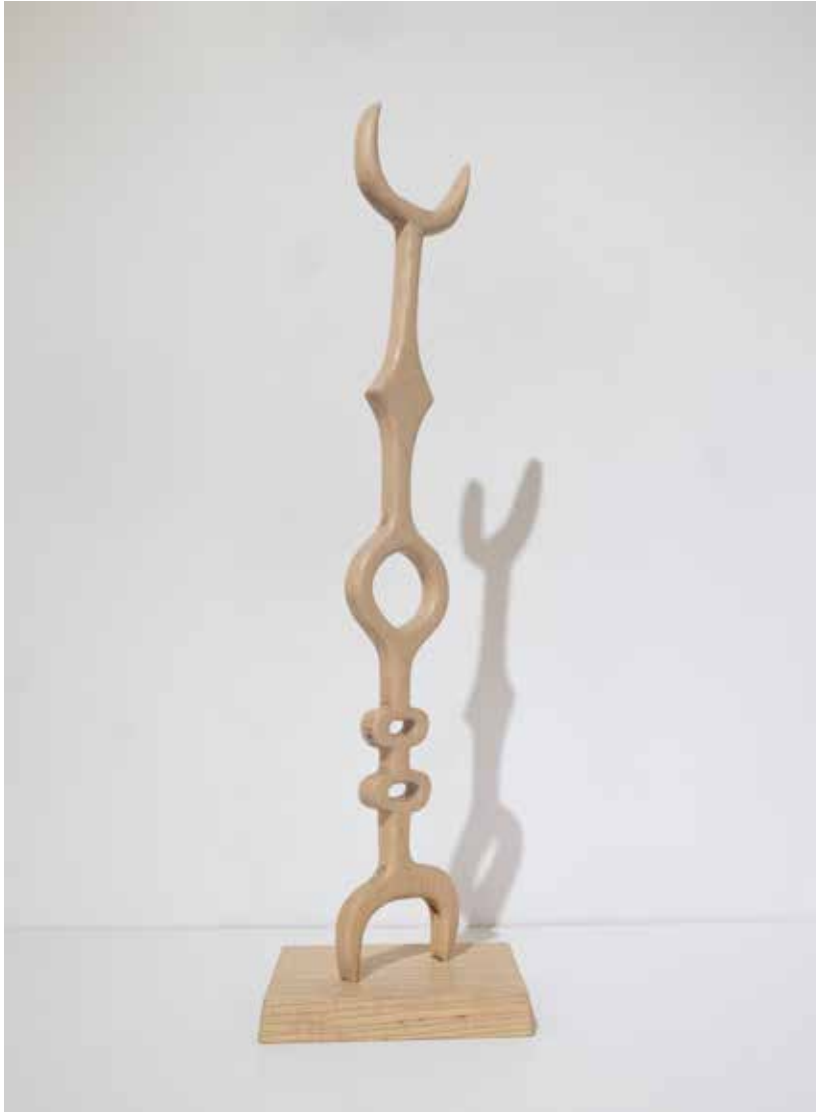
Things Rilke might say 2020 White beach wood 72cm x 19.5cm x 14.5cm R 14 000-00