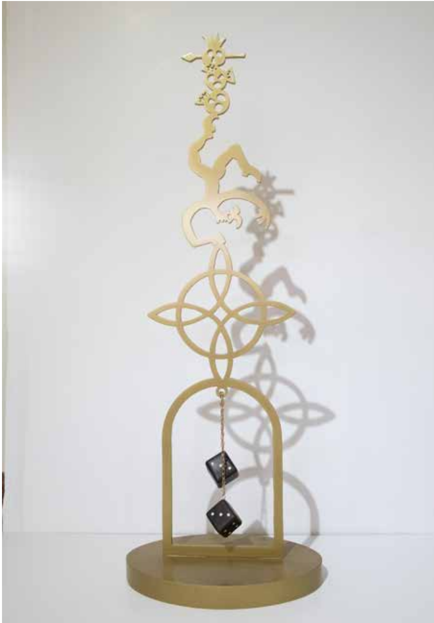
The music of chance