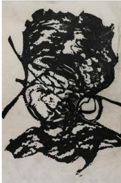
Granny 2018 Linocut 42.5cm x 32.5cm (framed) R 8 000-00