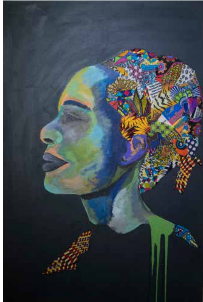
Napoli 2020 Acrylic and textile on stretched canvas 150cm x 100cm R 45 000-00