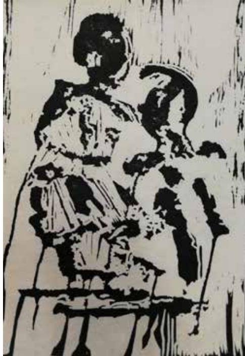
Eskia and Rebecca 2018 Linocut 42.5cm x 32.5cm (framed) R 8 000-00