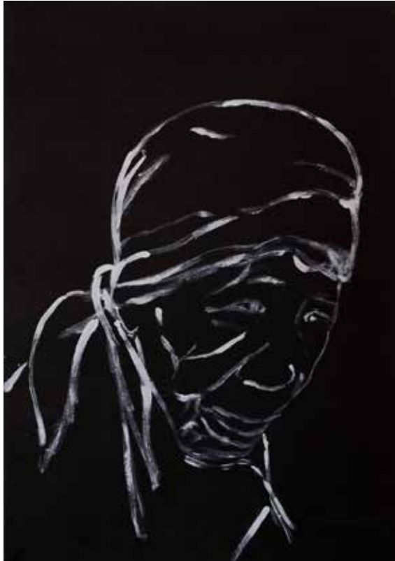
Maropeng II 2020 Acrylic on stretched canvas 69.5cm x 49.5cm R 9 000-00