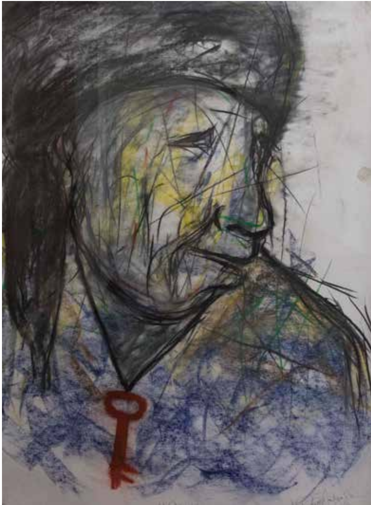
Artist's Granny 2018 Charcoal and pastel 81.5cm x 63.5cm (framed) R 20 000-00