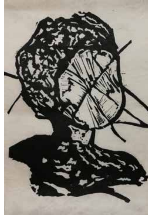
Nana 2018 Linocut 42.5cm x 32.5cm (framed) R 8 000-00