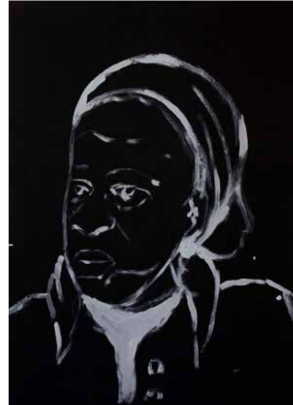
Rebecca III 2020 Acrylic on stretched canvas 69.5cm x 49.5cm R 9 000-00