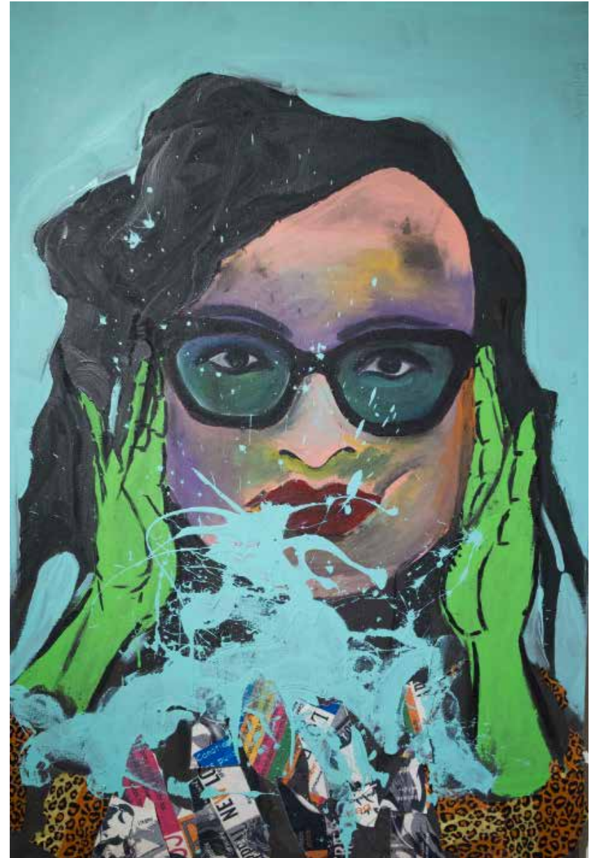
Ava I 2020 Acrylic and textile on stretched canvas 150cm x 100cm R 45 000-00