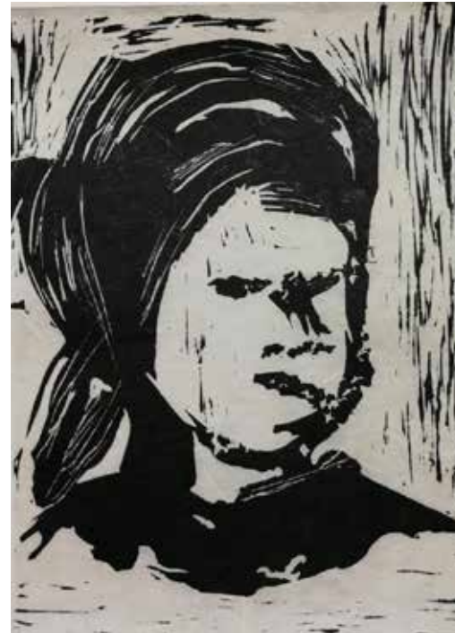
Grandmother 2018 Linocut 42.5cm x 32.5cm (framed) R 8 000-00