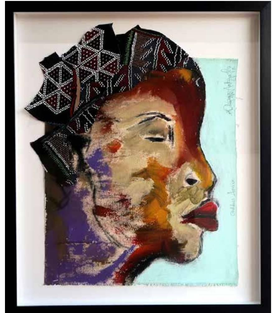
Goddess Africa 2018 Acrylic and textile on canvas 79cm x 66.5cm (framed) R 20 000-00