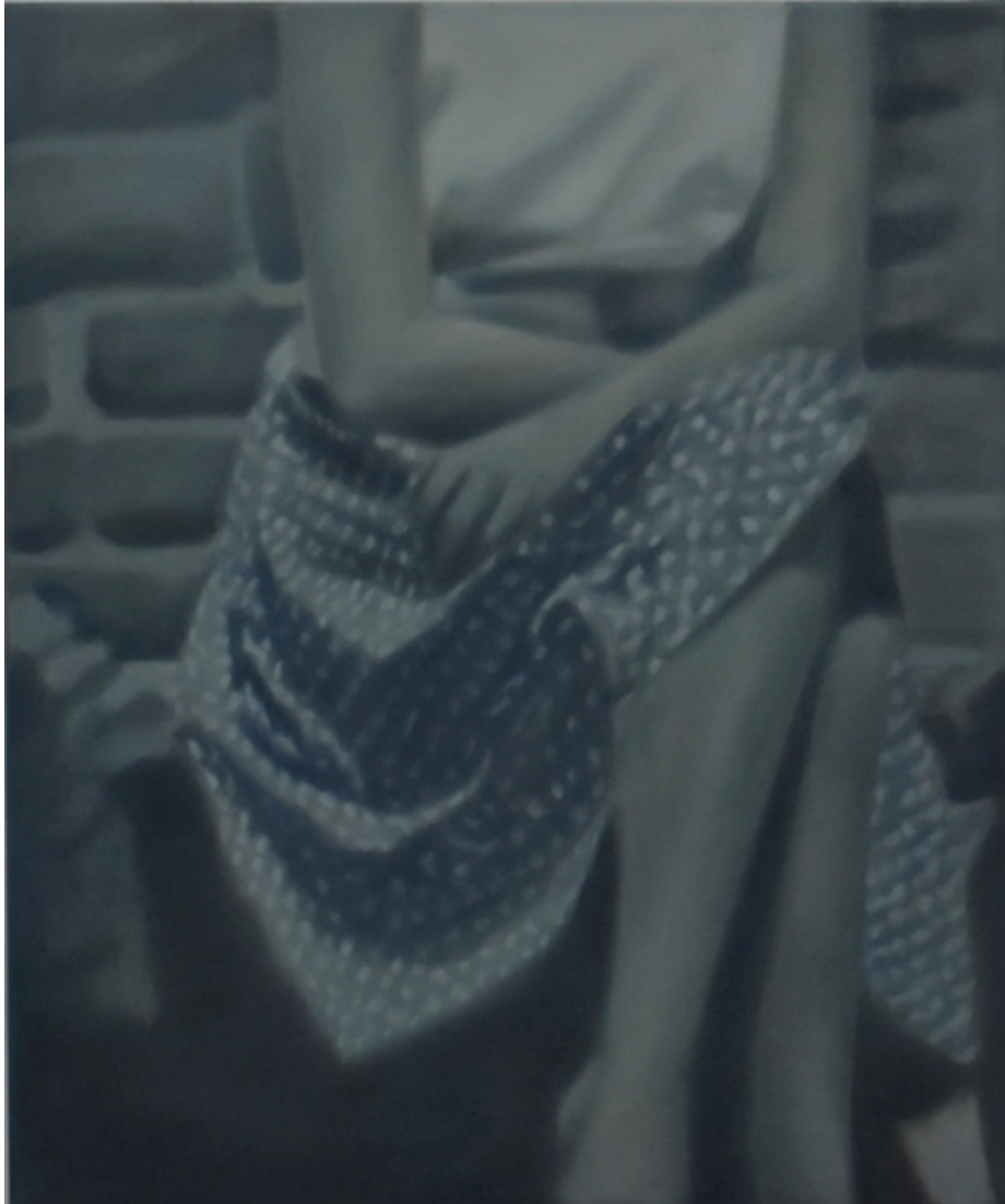
The polka dot skirt.

2020. Oil on canvas, 60 x 50 cm | R 19 200,00