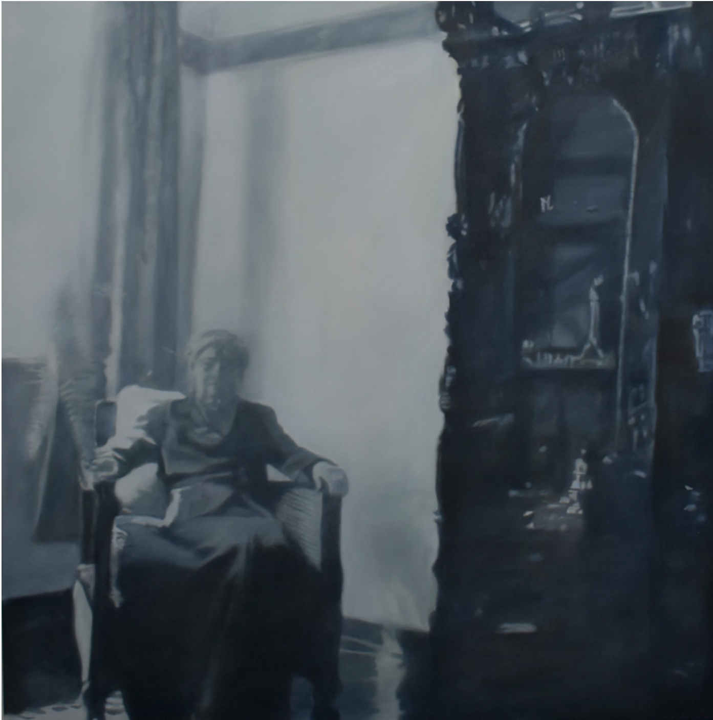
The display cabinet.

2020. Oil on canvas, 150 x 150 cm | R 60 000,00