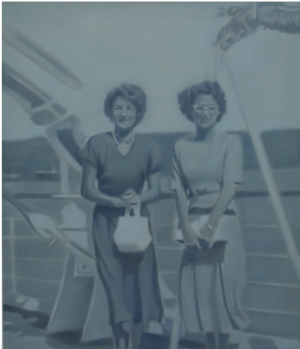
On the ship, late 1950s.

2020. Oil on canvas, 70 x 60 cm | R 22 000,00